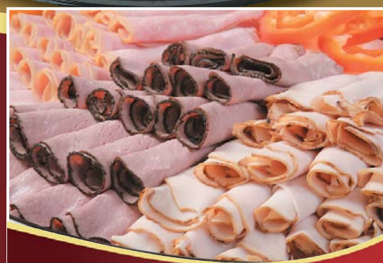
STORE BAKED PLATTER