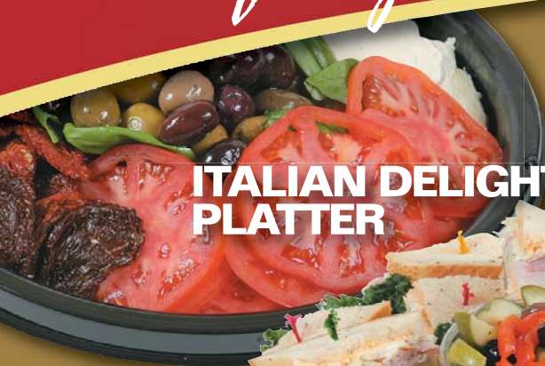
ITALIAN DELIGHT PLATTER