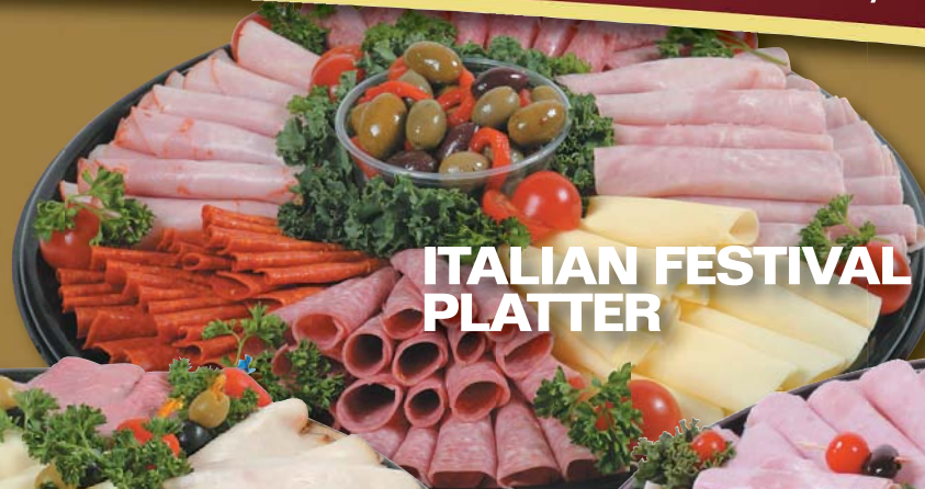
ITALIAN FESTIVAL PLATTER