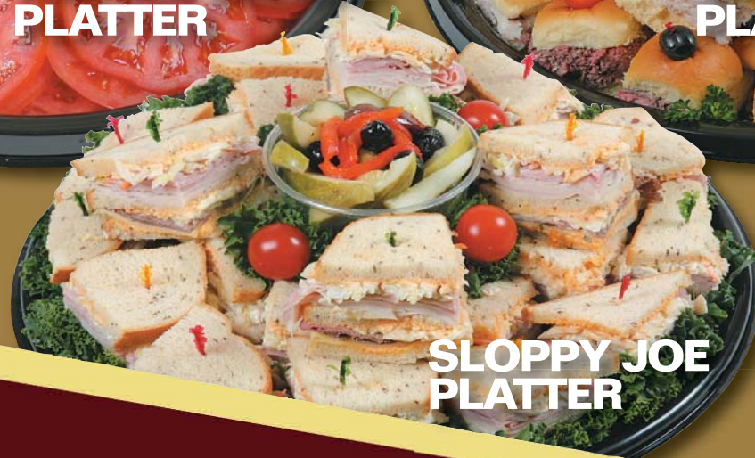
SLOPPY JOE PLATTER