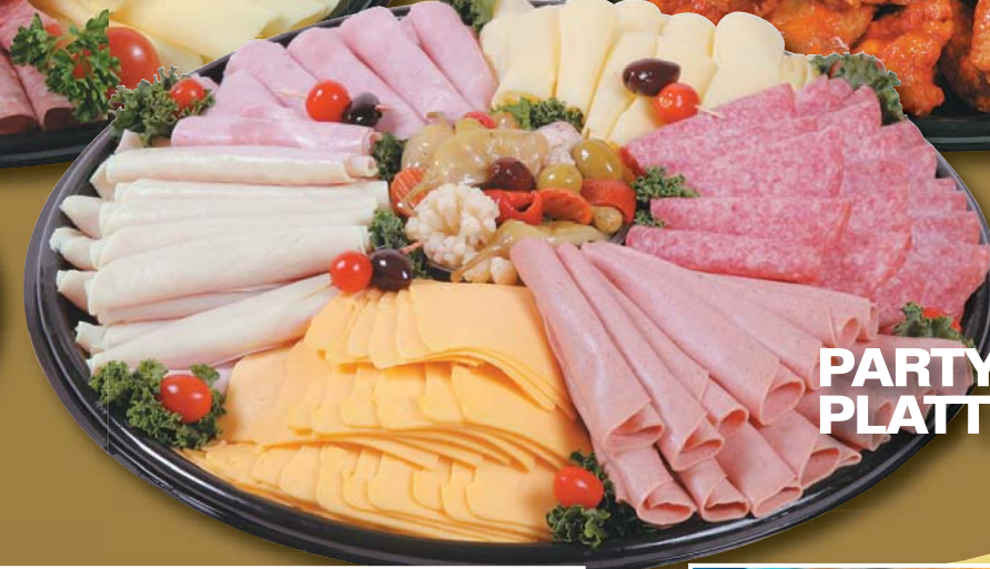
PARTY DELIGHT PLATTER