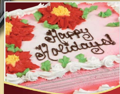
CUSTOMIZED SHEET CAKES