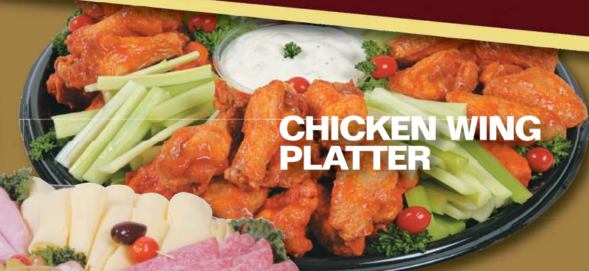
CHICKEN WING PLATTER